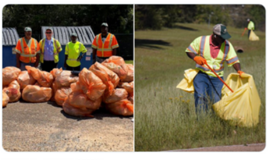
1:10 PM · Apr 27, 2023 · 1,366 Views

We're proud to participate in cleaning up our roadways! READ MORE: bit.ly/3AAaf5W #DoBeautifulThings